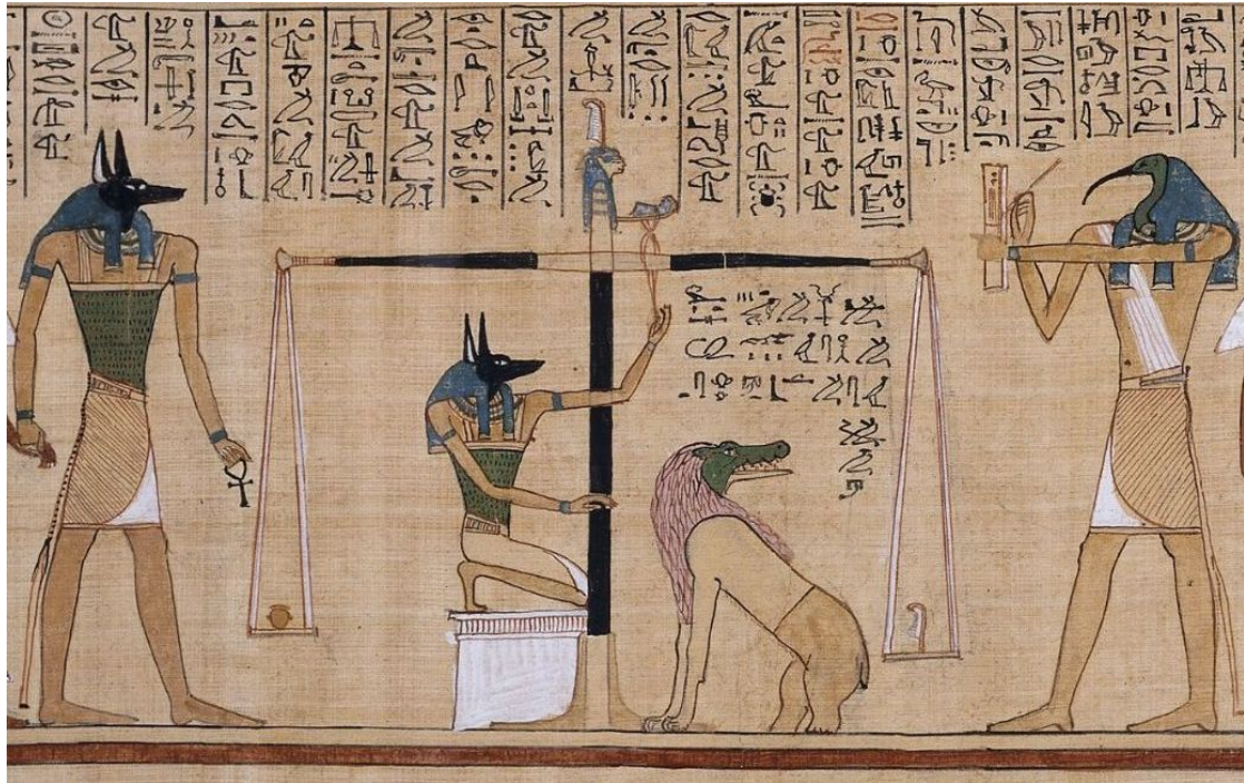
Figure 2. An Extract From the Book of the Dead

attaining the Egyptian afterlife, ensuring that the correct rituals were enacted, both at their deathbed, and after death. Those with less status were also aware of this particular eschatology: there is evidence that scribes had their own Book of the Dead, and those who created the funeral monuments had prayers and amulets inscribed for their own funerals, which included those from the Book of the Dead canon (James, 2007).