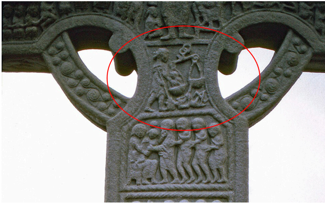
Figure 3. Cross of Muiredach, Monasterboice, County Louth, Ireland: East Face

Images of St Michael weighing souls are found throughout the medieval period, some carved in stone (Veelenturf, 2017) and others in later medieval paintings (Robens et al., 2014). One of the earliest known examples of this image during the Christian era, with the Archangel Michael performing the weighing task, is in Ireland (Harbison, 1992). On Irish high crosses, St Michael is depicted weighing souls, often in a contest with a tiny devil beneath the scales. For example, on Muiredach's High Cross (see Figure 3 ) this imagery is clearly represented.