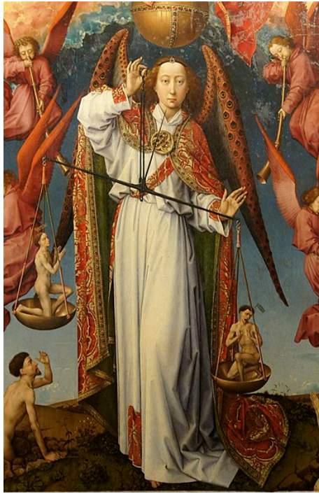
Figure 4. St. Michael Weighing the Souls, extracted from the Last Judgement (c.1445–50) by Rogier van der Weyden